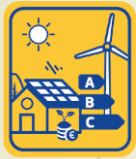
Clean Energy Transition