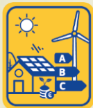
Clean Energy Transition